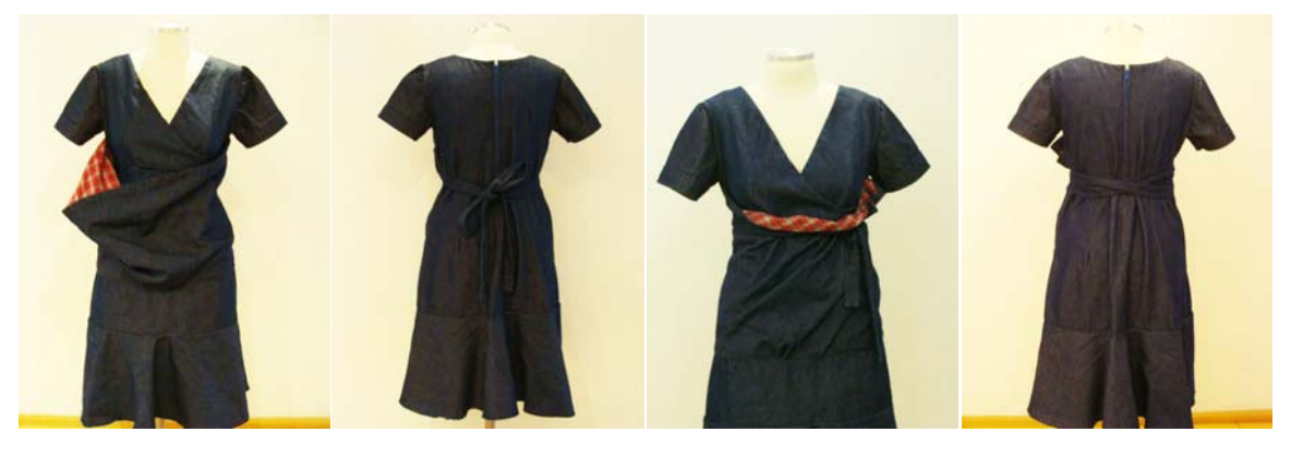
Fig. 4aFig. 4bFig. 4cFig. 4d

From the choice of materials and of the structural development of the dress based on functional and aesthetical concepts, the work is concluded with the prototype of the dress illustrated on figure 4.