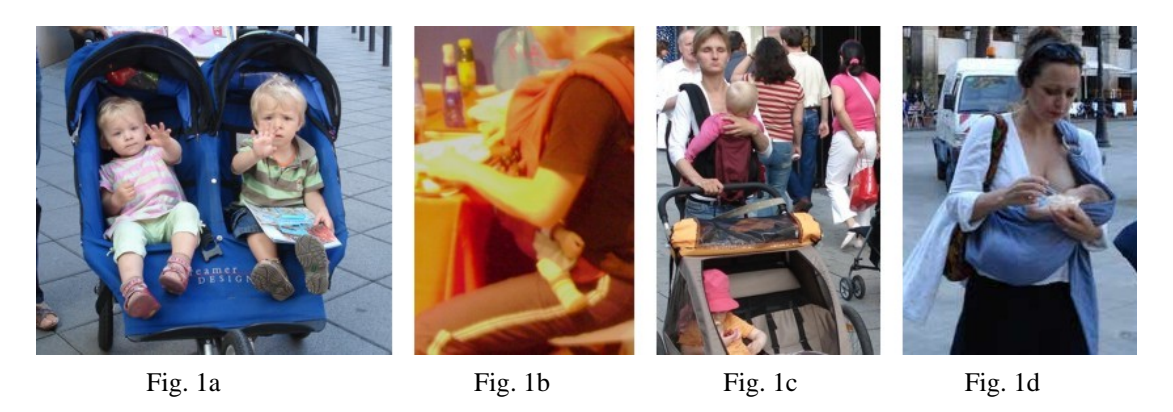
Fig. 1a - lack of mobility; fig 1b - difficult of breathing; fig - 1c warping legs; fig 1d - "baby sling"

Despite the fact that the marsupial seems to be a coherent mean of transport, some possible problems are not visually perceived. Then, the second stage initiates, with the research on the marsupial and inquiring mothers users of these marsupials.