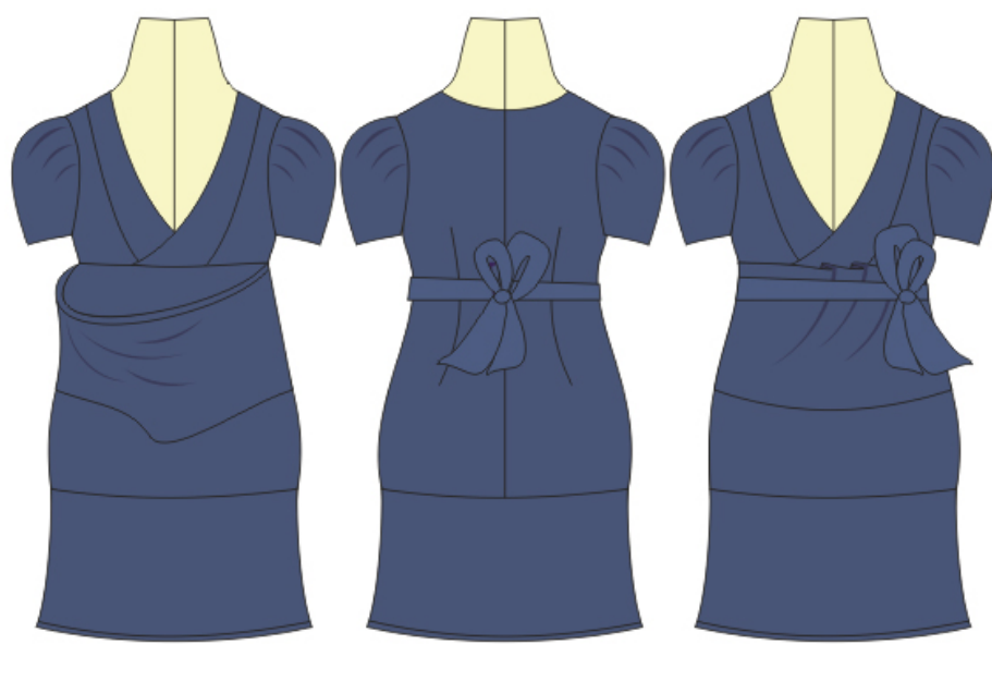
Fig. 3a - front